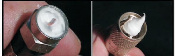
The amount of STUF to fill into the cap end of the connector is a matter of estimating the volume of the voids found within the connector after it is assembled. ( Fill with 2X Void Estimate )

Depositing a good fill amount of STUF is most easily done upon the center conductor of the " Cap " side of the connector assembly. When assembled and tightened; STUF is compressed, channeled into internal voids, reducing it's volume as the glass microspheres and teflon particles pack and the oils extrude into threads, machined borders and the cable braid area